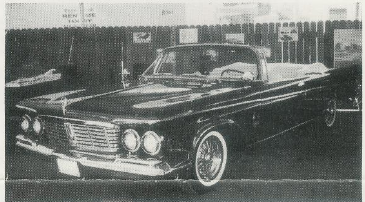
Carl Poteet's 1963 Crown Convertible

The American Pop Classic Car Show at the California State Fair is an eighteen-day event of diverse vehicular exhibits. The exhibit is open to various forms of transportation such as cars, trucks, rods, classics, etc. The exhibit allowed participating clubs or individuals the opportunity to exhibit their vehicles to an average daily attendance of thirty thousand State Fair visitors.