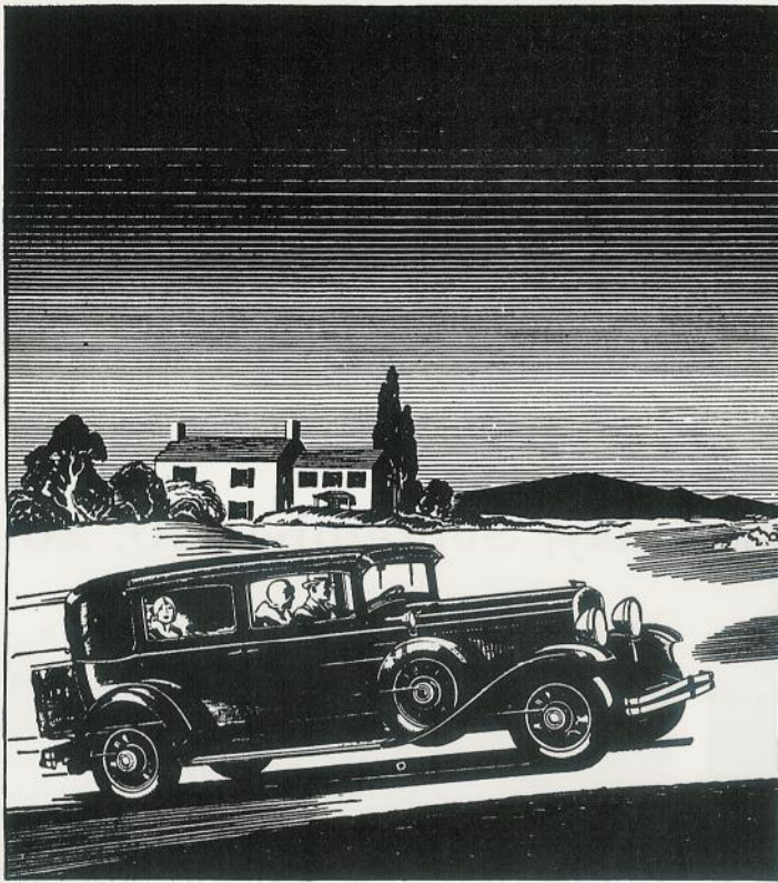
NEW CHRYSLER "77" TOWN SEDAN, $1795 (Special Equipment Extra)

Today, as always, what Chrysler does—or proposes to do—becomes the basic standard of efficiency in the realm of automobiles