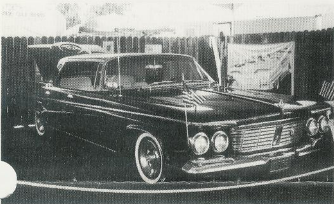
Bill Watkin's 1963 LeBaron 4 Door Southhampton

Imperials on Display Thursday, September 30, 2001